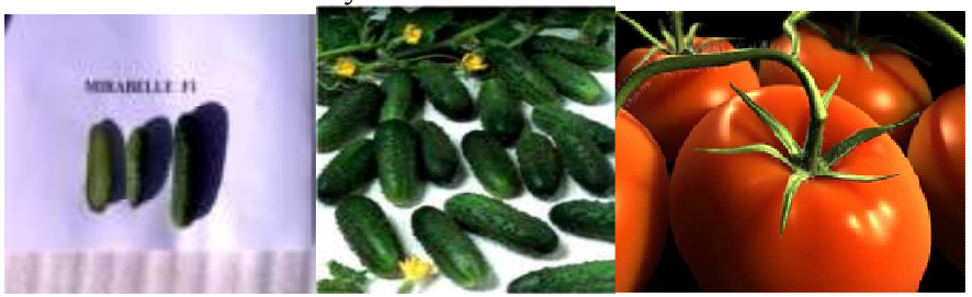
Fig. 1. The biological material used in the analysis

The biological material used in the analysis were the Sugardrop type of tomatoes with a high content of carbohydrates and C vitamin and the cornichon Mirabelle F_1 type of cucumbers (figure1) obtained through conventional and ecological culture technologies due to their nutrition importance, to their special preservation properties as well as due to their multitude of uses, due to the fact that they are used in many food products obtained in the food industry.