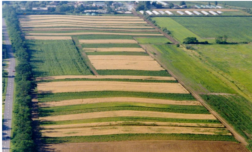
Figure 1: Landscape in Nyírség with Westsik's crop rotation experiment

and its biodiversity. Half the European Union's land area is farmed and it highlights the importance of farming in a natural environment. Farming has contributed to creating and maintaining a variety of valuable semi-natural habitats. Under the Common Agricultural Policy (CAP) farming and nature exercise a profound influence on each other. Farming also supports a diverse rural community that is a fundamental asset European culture and plays an essential role in sustainable agriculture. The links between the natural environment and farming practices are complex. Agricultural practices can also have an adverse impact on natural resources. Pollution of soil, water and air, fragmentation of habitats and loss of wildlife can be the result of inappropriate agricultural practices and land use. EU policies are therefore focused on reducing risks of environmental degradation, while encouraging farmers to continue playing a positive role in the maintenance of the countryside Ángyán et al. (2000), (EC) 1698/2005.