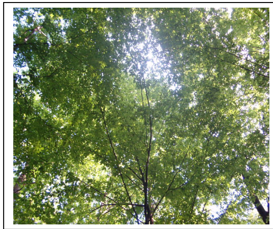
Fig. 1 –The appreciation of the consistency value in the stand from unit 87 B that is to be processed with cultural operations

The values of thickness and density are unitary and supra-unitary, thus the consistency of the stands analyzed is full - fig.1., the stands being relatively dense.