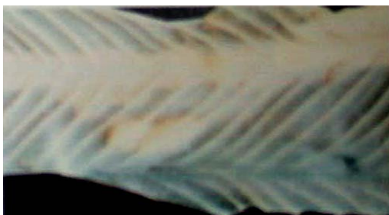
Figure 3 - The appearance of focal intestinal mucosal histology corresponding initial carcinoma without achieving its muscle.

Making a difference in average test and bilateral variables, we can say that, at a value of 5%, there was no difference between the average number of benign and malignant tumors.