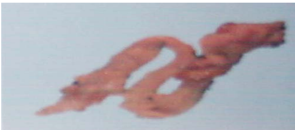
Figure 1 - Appearance of macroscopic colorectal malignant lesions induced in mice with DMH after 12 weeks