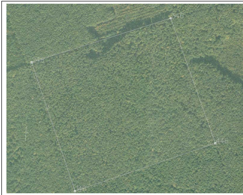
Fig. 3. Racing details with conventional technology (total station), the traverse total station method

Parcel area 46 determined by the analytical method Mapsys 7.0 program is S = 180,993.01 \text{ m}^2 and perimeter P = 1703.61 \text{ m} .