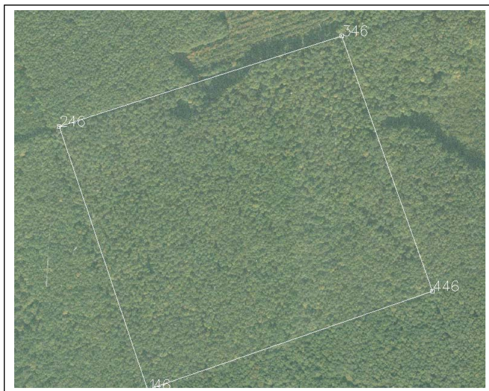
Fig. 1. Racing details GNSS technology fast static method

Analyzing data from the table 2 and that the diagram in fig. 2 it is noted that all the characteristic points are determined altimetric and planimetry standard deviations below the tolerance even within the built-up area (<10 cm).