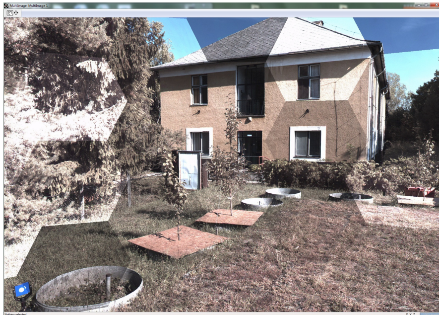
Fig. 2 Digital image mosaic of the seventh scan station

On 3 rd September 2011 the investigated trees was scanned by Leica ScanStation C10 laser scanner. The instrument uses the time-of-flight (TOF) principle for ranging. A short laser pulse is emitted towards the object and is reflected on its surface; a part of the reflected radiation comes back to the scanner where it is detected by a sensor. The fast determination of objects is provided by a high scan rate of up to 50,000 points/sec. The emitted laser beam is 532 nm wavelength, so the color is green. The green laser light sweeps the objects; the deflection of laser beam is occurred by a Smart X-Mirror™ automatically spins polygon mirror system. Thus the scanner creates with high speed a point cloud. The maximum range of laser scanner is 300 m; it is depend on the albedo. The coherence of laser beam is high, but if increase the range – increase the beam divergence too – so the scanning error is more and more bigger. Because of the larger beam diameter is more probability that the laser beam hits an edge on the object, so the beam is split in two parts. The result of this mixed edge problem is inaccuracy of distance. This error is bigger in case of vegetation scanning, because the plants have less plain parts, like e.g. buildings. The beam divergence is 0.1 mrad; it means that the diameter of laser point is 10 mm on 100 m. This value is – in case of maximal measurement distance (on 300 m) – only 3 cm.