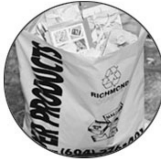
Fig. 1 Recycling bag

From practice we can conclude that a strong position in the negotiations between partners depends of the cooperative methods, they are offered to the two partners, and their willingness to implement them. What I find significant and required especially in Romania, is this rule in the waste and packaging field.