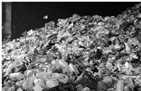
Fig. 2 Plastic wastes collection