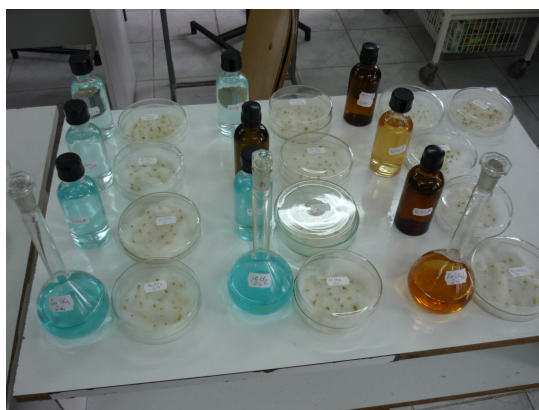
Fig.1. Organization of study groups