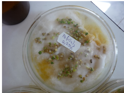
Fig 3. \text{Fe}_2(\text{SO}_4)_3 0,25% solution

All \text{NiCl}_2 concentrations used in this study lead to total inhibition, 100% germination of seeds of Sinapis alba L., becoming whitish.