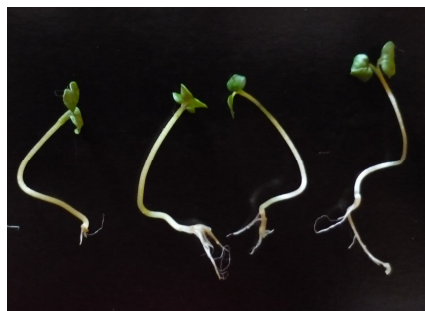
Fig.4. Control at 72 hours

At the solutions of \text{Pb}(\text{NO}_3)_2 , for the seed lot treated with solutions of \text{Pb}(\text{NO}_3)_2 2% and 1%, we get a percentage of 15% of seeds germinated, but these concentrations are toxic. At lower concentrations, 0.5% and 0.25% we observed a significant increase germination capacity, up to 85% and 90%, demonstrating concentrations to be less toxic.