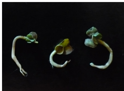
Fig.6. \text{Fe}_2(\text{SO}_4)_3 2% solutions at 72 hours

\text{Fe}_2(\text{SO}_4)_3 solutions by different concentrations acted differently on germination capacity. At higher concentrations, the germination is inhibited, seedlings are less developed compared to the control group, leaves