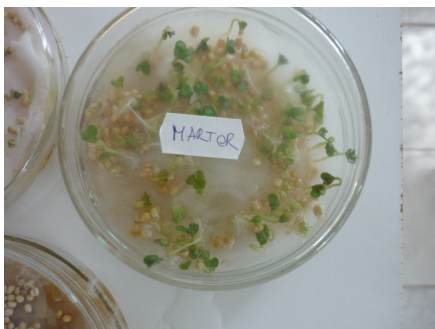
Fig 2. Control