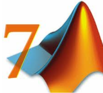
Fig.1 Matlab logo.gif

PDE ToolBox solves partial differential equations using finite element methods [MathWorks, 1984-1997].