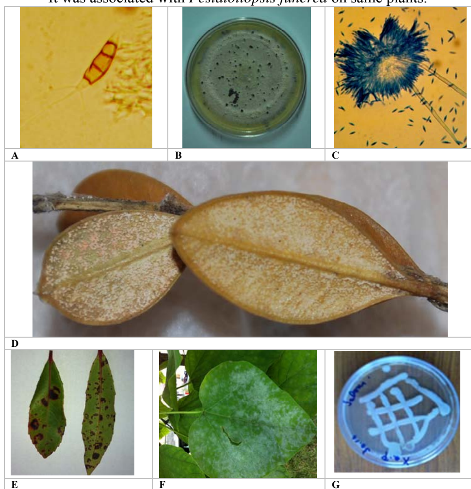
Fig. 1. Photos: A – conidia of Pestalotiopsis funerea x100: B – culture on MA of Pestalotiopsis funerea : C – setae, phialoconidia, groups of conidiophores with phialides x40 of Volutella buxi : D – sporodochia of Volutella buxi on leaf underside: E – lesions of Xanthomonas arboricola pv. pruni on Prunus lusitanica : F – Erysiphe elevata on leaves of Catalpa bignonioides G – culture of Xanthomonas arboricola pv. pruni on Sabouraud medium (Photos O. Hâruga).

It was associated with Pestalotiopsis funerea on same plants.