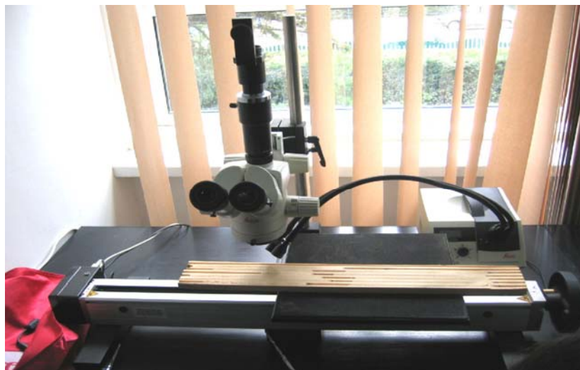
Fig. 3. The system Lintab for measuring annual ring width

Number of trees included in the survey range from 15 to 25 trees. Annual ring width measurement was performed using the system Lintab at Forest Research Station Câmpulung Moldovenesc (Fig. 3). Accuracy of tree ring width measurements was 0.001 mm (Rinntech, 2005). Values measured for each sample were recording in separate files for each experimental plot using the standard format TUCSON format (*.rwl).