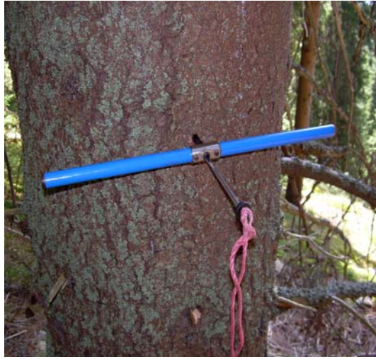
Fig. 2. Pressler increment borer

Number of trees included in the survey range from 15 to 25 trees. Annual ring width measurement was performed using the system Lintab at Forest Research Station Câmpulung Moldovenesc (Fig. 3). Accuracy of tree ring width measurements was 0.001 mm (Rinntech, 2005). Values measured for each sample were recording in separate files for each experimental plot using the standard format TUCSON format (*.rwl).