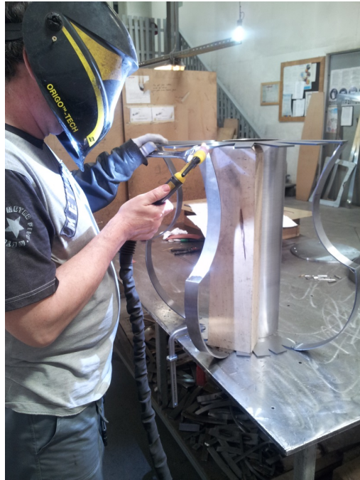
Image 4. Welding steel bands.