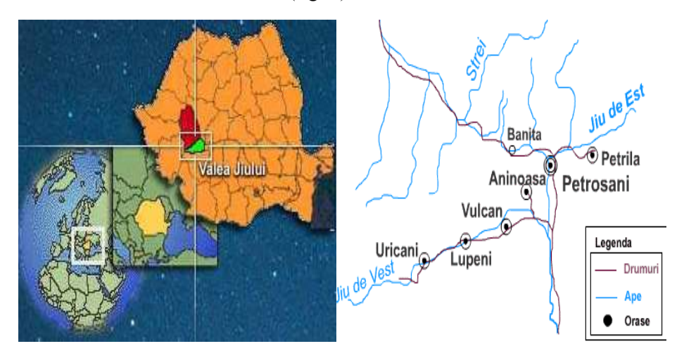
Fig. 1. Layout and composition Jiu Valley

In the south of Hunedoara county, in a triangle proved to be golden, on the border between Transylvania, Banat and the Romanian Country, lies an area known generically under denu - groom " Jiu Valley " and geographically that " Petrosani Depression " region that has earned the reputation as the " Land of black Diamond " (fig. 1).