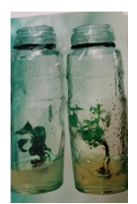
Fig 3. Caulogenesis on Rareş cultivar