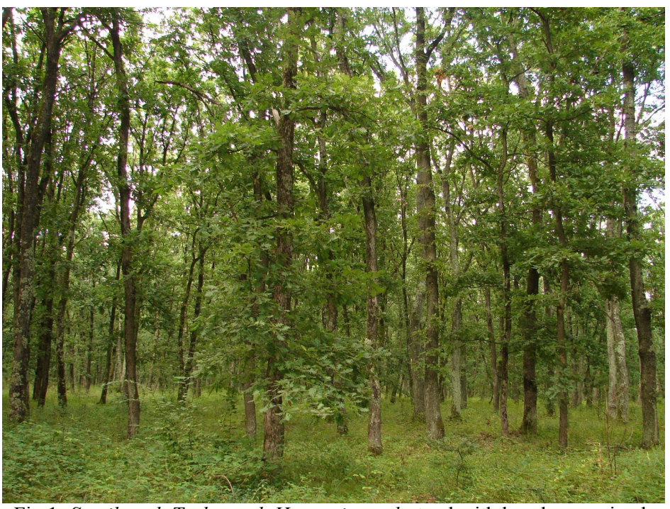
Fig 1: Sessile oak-Turkey oak-Hungarian oak stand with hornbeam mixed with Genista-Festuca heterophylla, u.a. 84A, U.P.II Sititelec area, (photo - P.T. Moţiu)